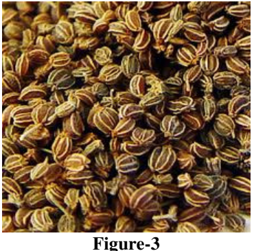
Figure-3 Fruit/ Seeds

According to the FDA standards of identity, Celery seeds are the dried fruit of a biennial herb, Apium graveolens Linn; light brown to brown-color, having characteristic celery aroma and a warm, bitter taste. The quality characteristics are measured by the volatile oil, non-volatile ether extract, total and acid insoluble ash<sup>15</sup>.